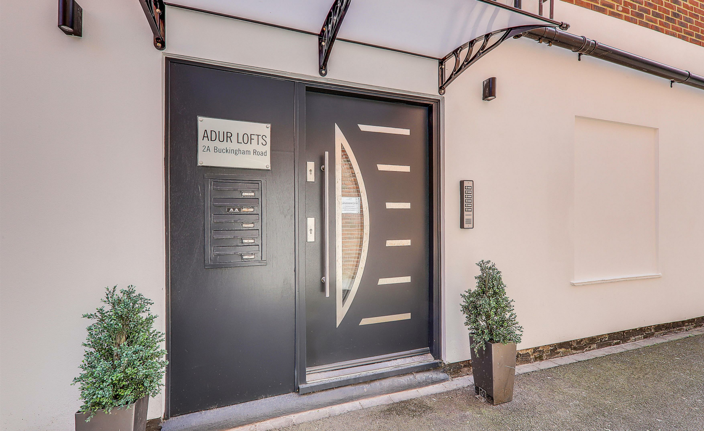
Flat 2 Adur Lofts, Buckingham Road, Worthing, BN11 1TH Price £250,000